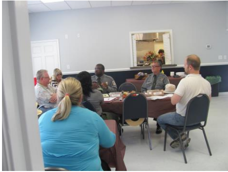
[Thoroughbred Country of South Carolina Meeting 2013]