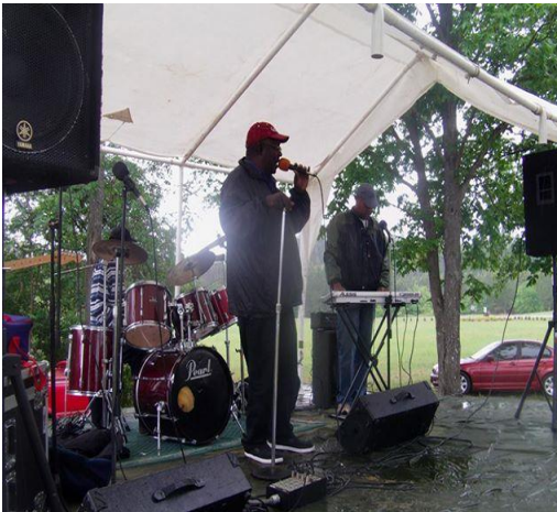
[May Day Event 2013]