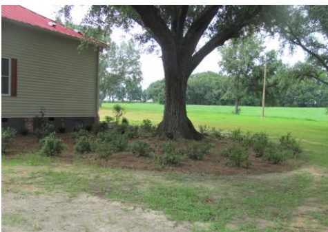
[Backyard View of Middle Place]