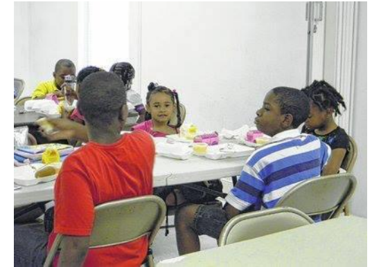
[Summer Feeding Program - Summer 2013]